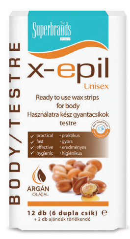
• XE9215 • Ready to Use Wax strip for body - Argan oil, 12pcs