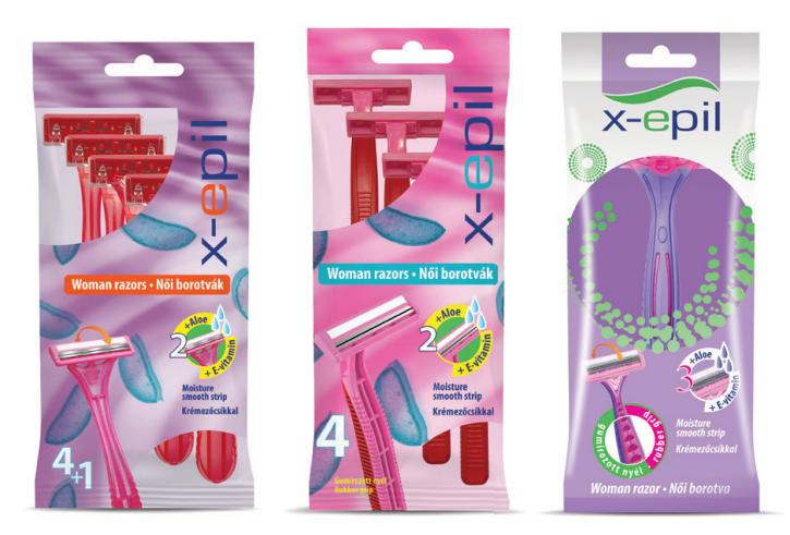
• XE9239 • X-Epil Disposable woman razors triple blade 3+1/pack

• XE9241 • X-Epil Disposable woman razors with twin blades 5pcs/pack • XE9234 • X-Epil Disposable woman razors with twin blade 4pcs/pack • XE9240 • X-Epil disposable woman razor triple blade-1 pc