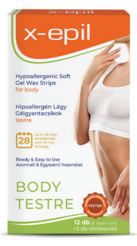
• XE9249 • Ready to Use Hypoallergenic Gel Wax Strips for body, 12 pcs