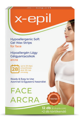
• XE9245 • Ready to Use Premium • XE9248 • Ready to Use Hypoallergenic Gel Wax Strips for face, 12 pcs